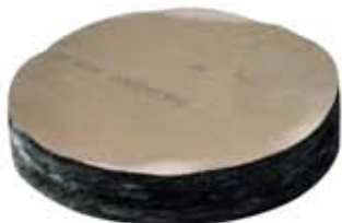
HEAT REFLECTOR for use with 12v and 240v halogen fittings.